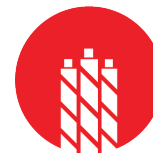
Stripping, Dying, Twisting