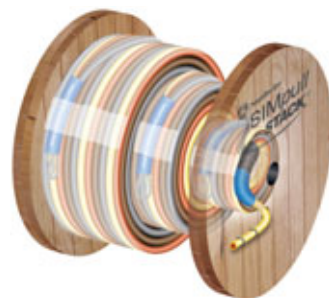
Cut lengths of colored parallels, separated by stretch wrap, combined on one reel in the order of your pulls.