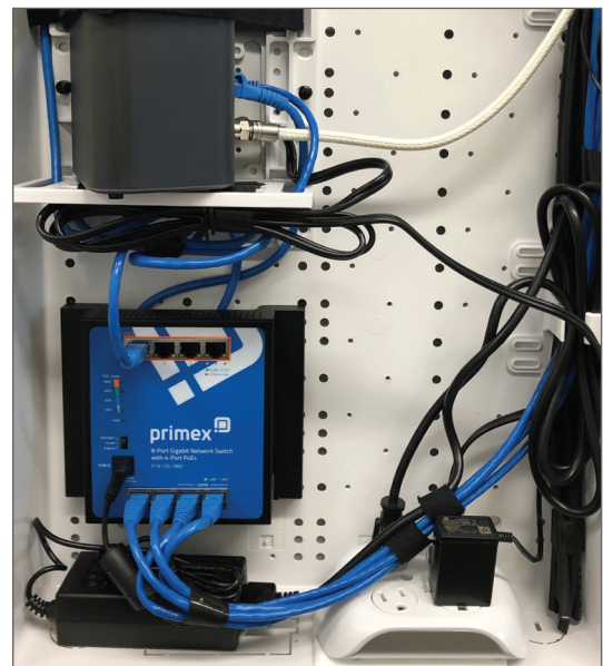
Quickly installs in Primex SOHO Pro™ media panels.