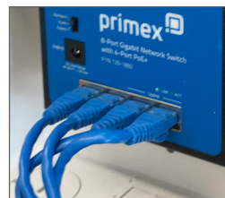
Easy access front RJ45 and power connections.