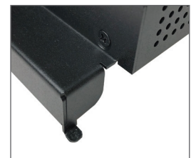
Unique mounting system allows for installation in seconds.