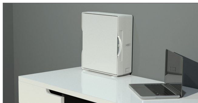
Freestanding (w/accessory feet)