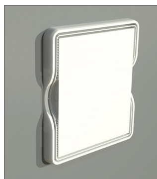
New construction (Greenfield) in-wall Installation