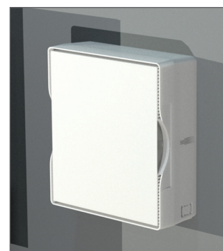
Retrofit construction (Brownfield) on-wall Installation