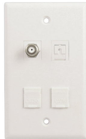
Fits standard wallplates (sold separately)