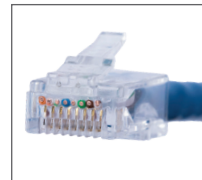
Cat6/5e UTP Snap Plug