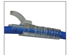
Boot for UTP Snap Plug