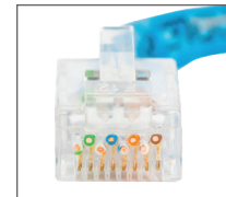
Cat6a UTP Snap Plug